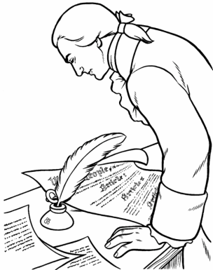
The Constitution | the supreme law of the land